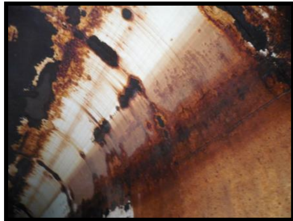
Mt Olive water tanks before.