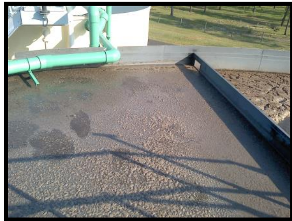
Digester at Cardinal Hill