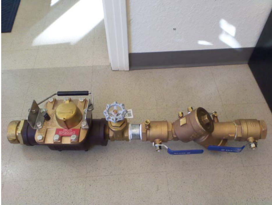
New fire hydrant water meter purchased for use by contractors