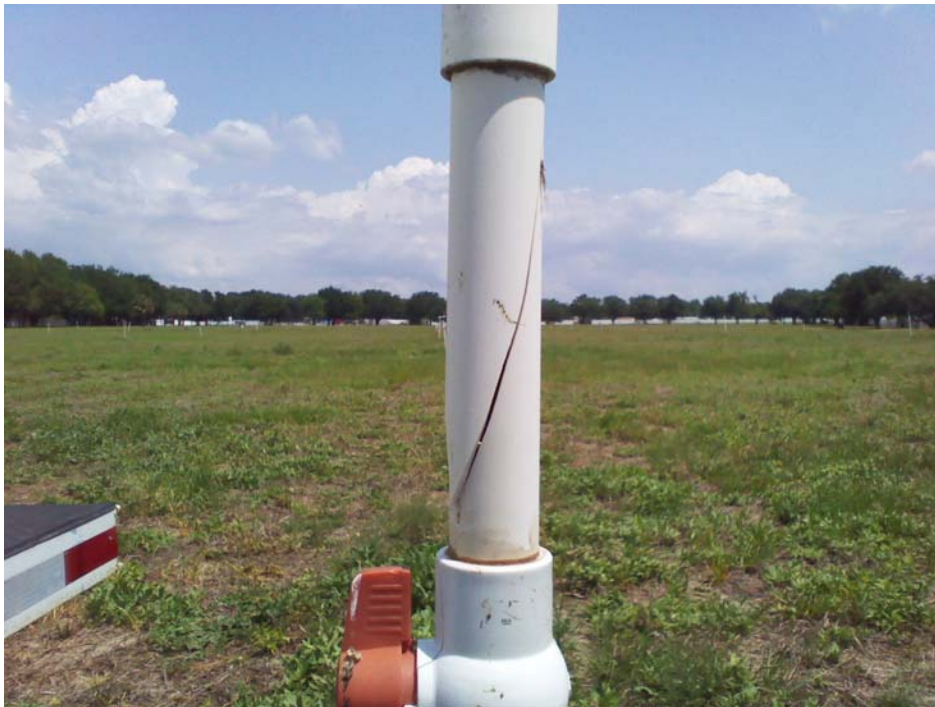
Typical failure of sprayfield piping due to sunlight and weather