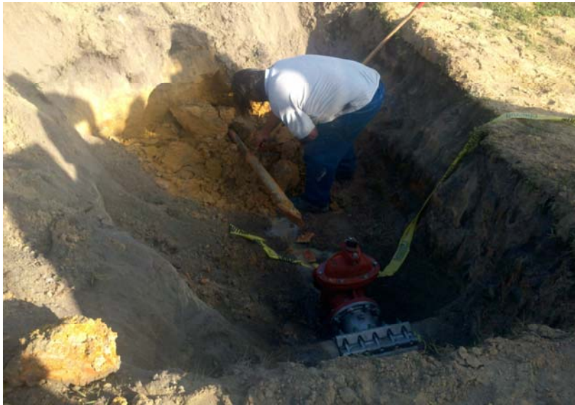
Directional bore of new fire water main for new Dollar General Market Place