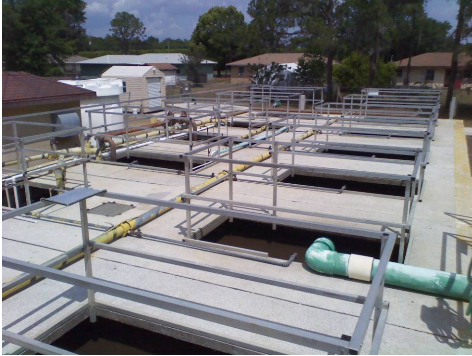
Mt. Olive WWTF after pressure cleaning.