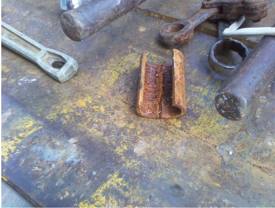
Broken shaft coupling that caused the Commonwealth well to fail. Side note there were three other couplings cracked along the shaft as well.