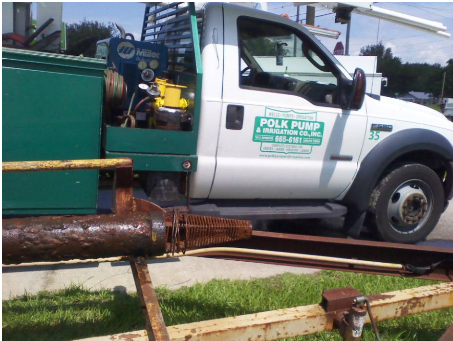
Broken strainer on the bottom of the well column.