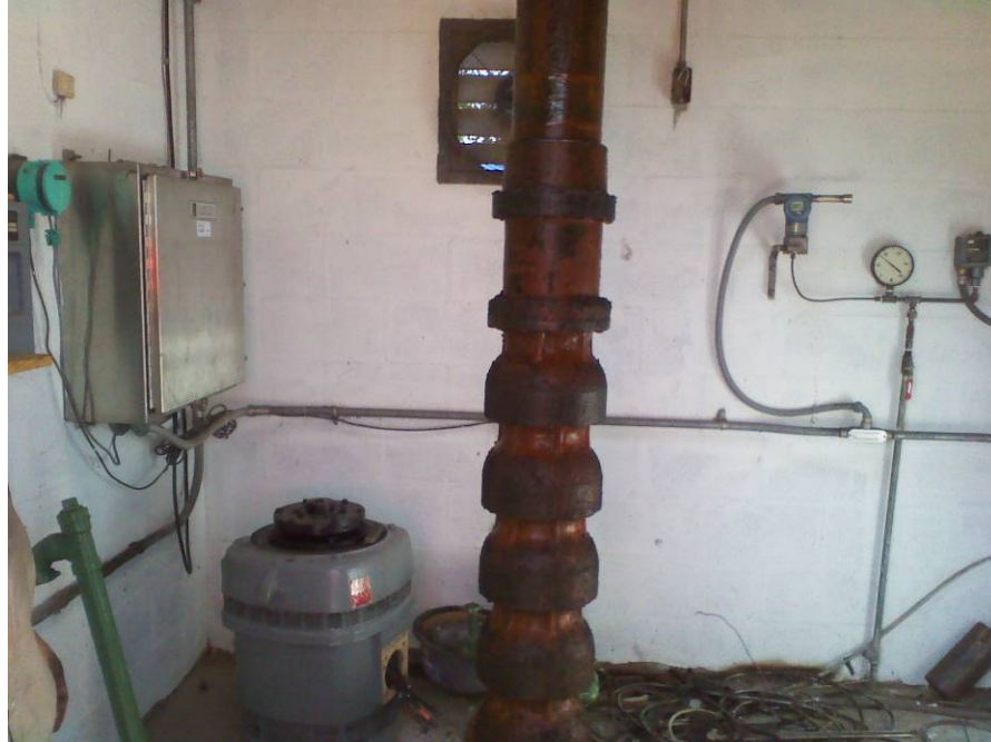
Pump bowls at base of Commonwealth well pump.