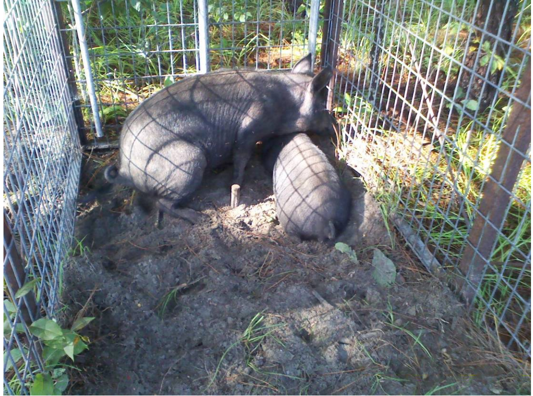
The residents of the Cardinal Hill facility that are causing all the damage.