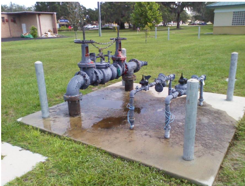
Leaking water line going into city hall.