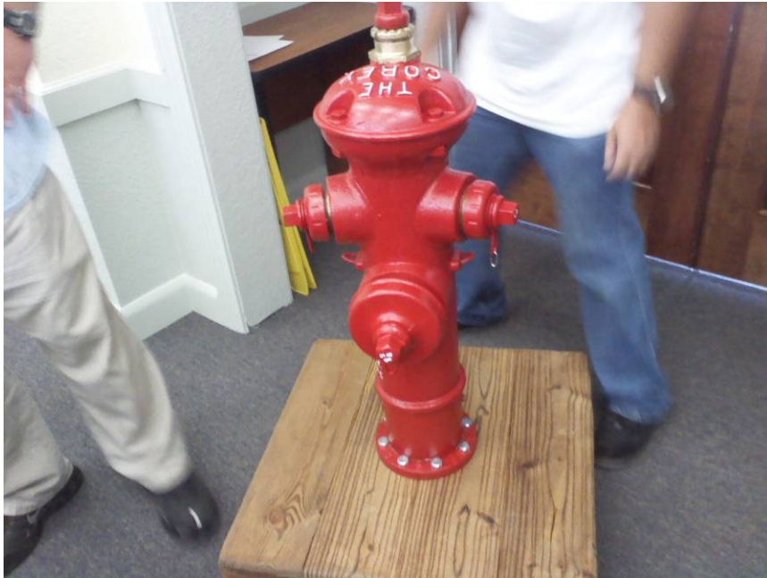
Refurbished antique fire hydrant on display in city hall.