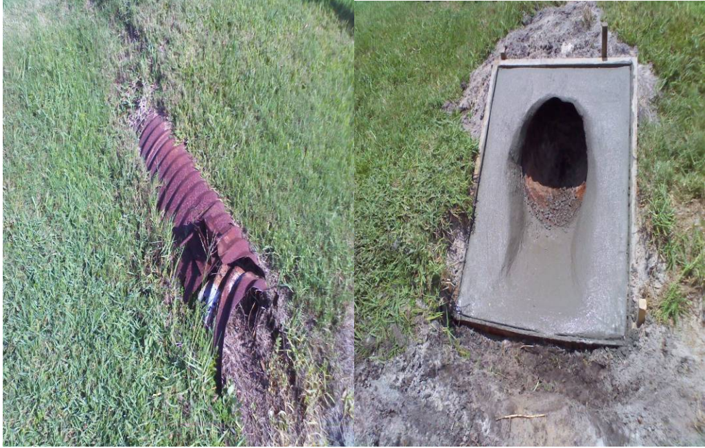
Before and after pictures of the storm drain repair for the city.