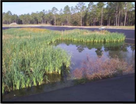
Cardinal Hill retention pond