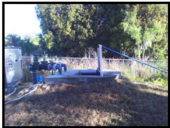
The new Golden Gate liftstation.