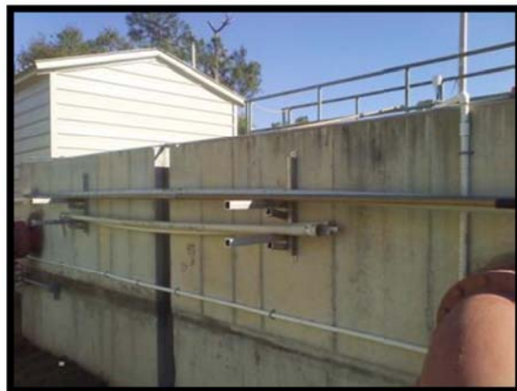
Installed racks for spare materials and scrap parts removed from Mt. Olive WWTF.