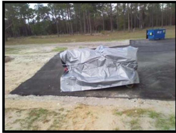
Spare pumps pulled from liftstation upgrades.