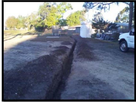
Ran new phone and water line to LS#12.