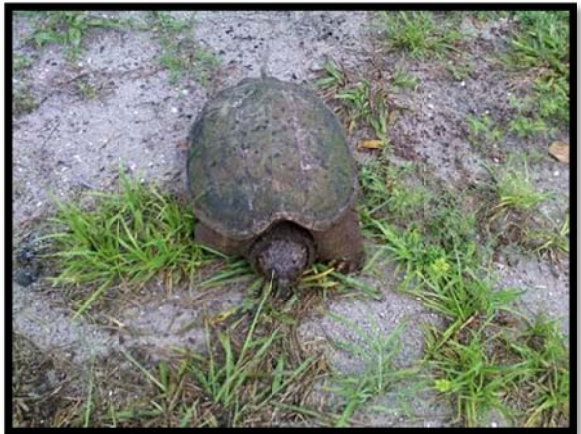
Some of Polk City's local wild life.