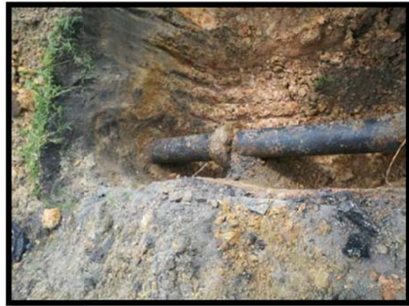
One of the city's gravity flow sewer manholes. One of the city's ductile iron water mains.