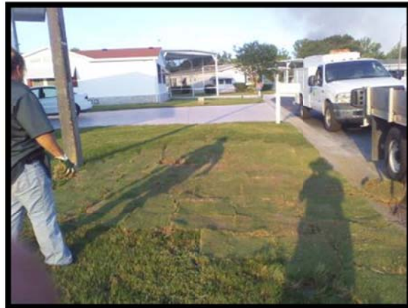
Leak repair on Island View Circle North. (before and after)