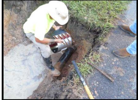
Cracked 6 inch water main on Oak Ave.