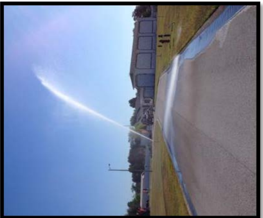
Broken sewer line and water line.