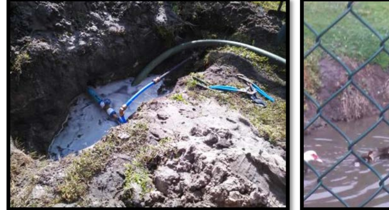
Water leak repair at the end of water line.