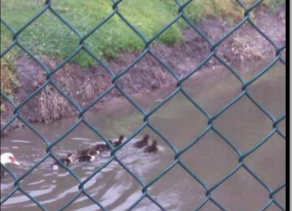
Very little critters.