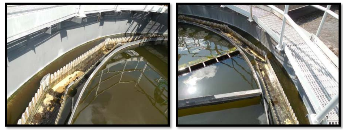
Cardinal Hill Clarifier