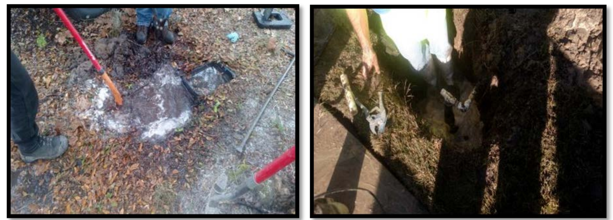
A couple of different water leaks during February.