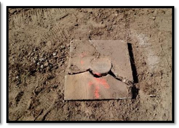
Broken valve box on Meandering Way.