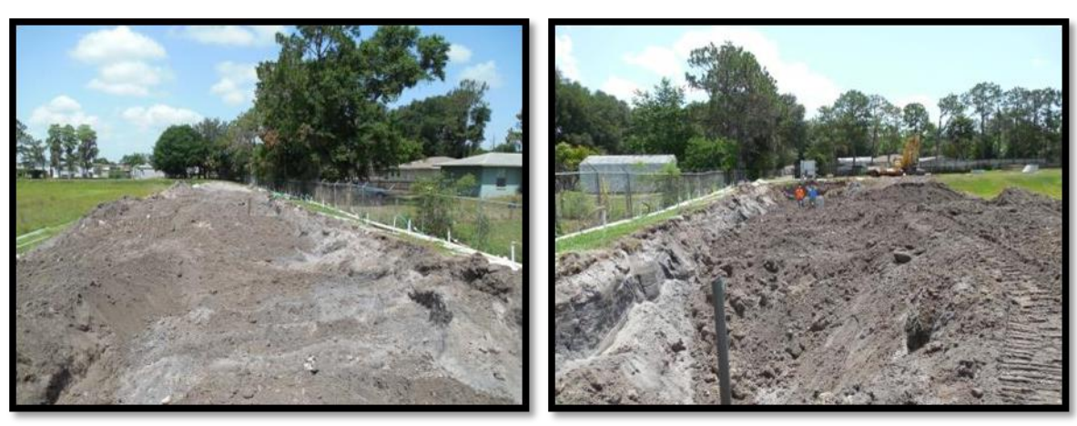
Sewer line replacement behind Duey Rd.